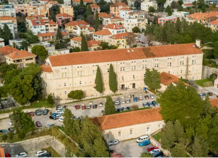
Underwater Heritage Showroom At Croatian Maritime Museum Split