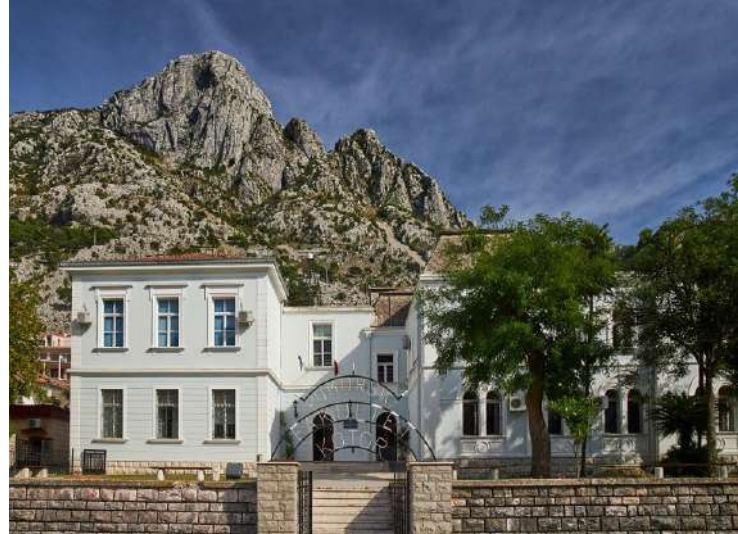
Underwater Heritage Showroom At Faculty Of Maritime Studies Kotor