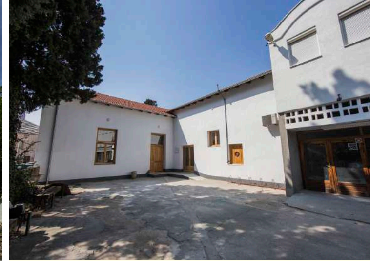
Underwater Heritage Showroom At "Brodari" Building In Mostar