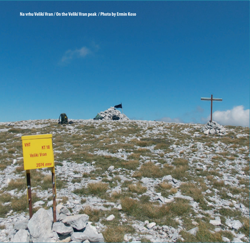
Na vrhu Veliki Vran / On the Veliki Vran peak