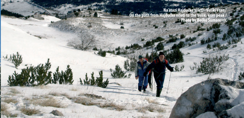
Na stazi Hajdučke vrleti - Veliki Vran / On the path from Hajdučke vrleti to the Veliki Vran peak