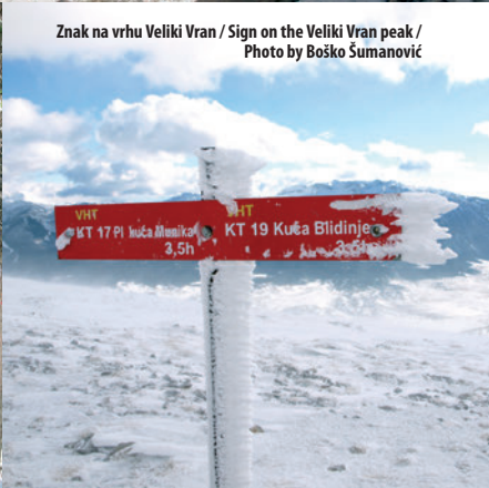
Znak na vrhu Veliki Vran / Sign on the Veliki Vran peak