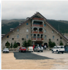
Motel Hajdučke vrleti u Parku prirode Blidinje / Motel Hajdučke vrleti in nature park Blidinje

blizini vrela se nalazi raskrižje staza od kojih jedna vodi prema Malom Vranu, spojenog s Velikom Vranom planinskim hrptom višeg od 2000 metara. Vrh Veliki Vran je označen, a kao nagradu za uspješan uspon planinari dobivaju fantastičan pogled na tri okolna jezera: Ramsko, Buško i Blidinjsko.