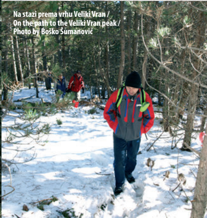
Na stazi prema vrhu Veliki Vran / On the path to the Veliki Vran peak / Photo by Boško Šumanović